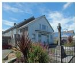
Dobwalls Memorial Hall date and time to be agreed

Come along and tell us what you think should happen!