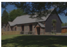
Doublebois Park Centre Date and time to be agreed

This autumn we will be setting up a series of meetings with local Communities and other stakeholders to check that we have not missed any opportunities or misrepresented our parishioners' views.