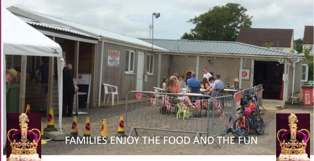
FAMILIES ENJOY THE FOOD AND THE FUN