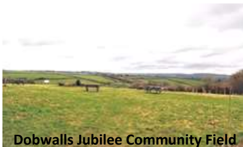
Dobwalls Jubilee Community Field