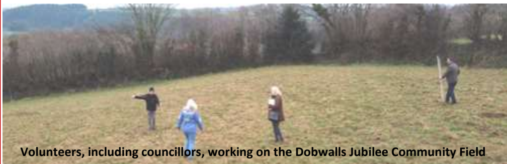
Volunteers, including councillors, working on the Dobwalls Jubilee Community Field