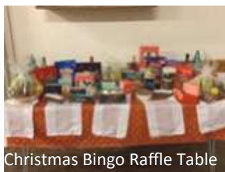
Christmas Bingo Raffle Table