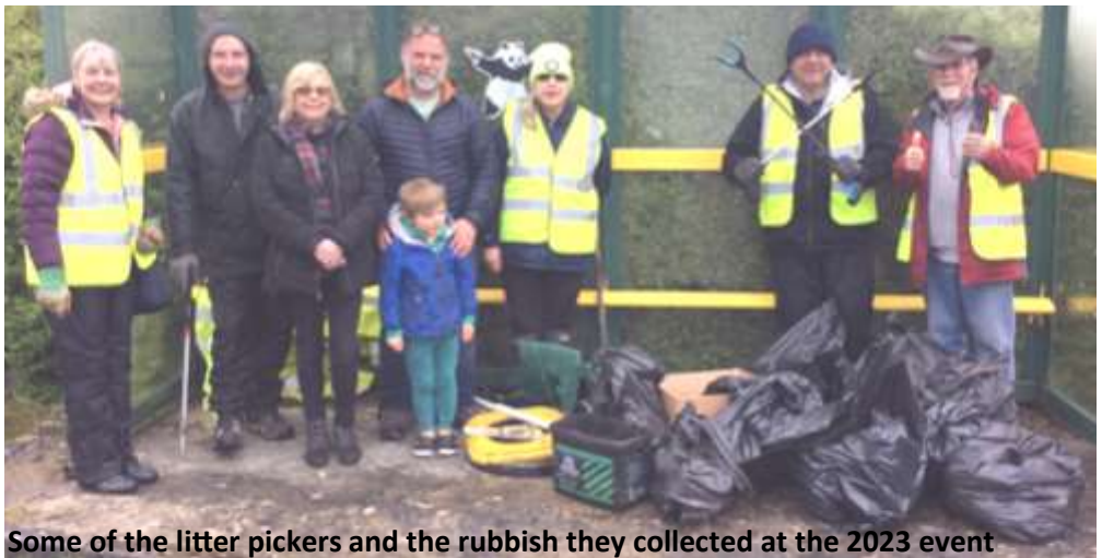
Some of the litter pickers and the rubbish they collected at the 2023 event

And the place to meet is: The village car park, next to the pub car park